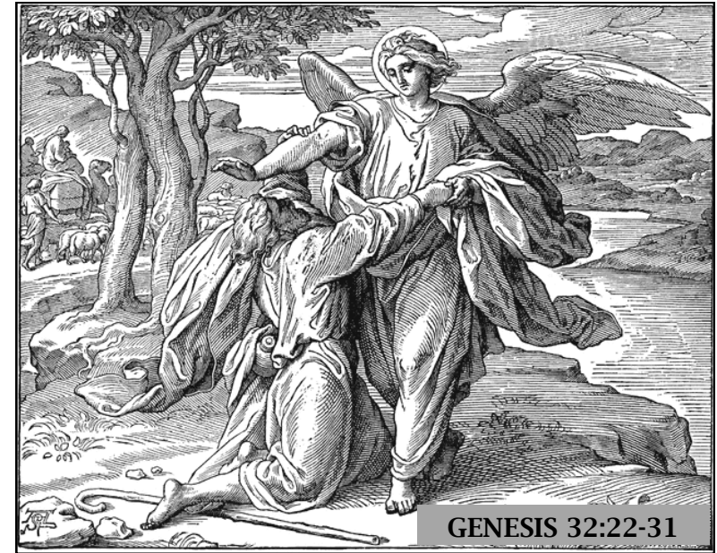
Illustrators of the 1897 Bible Pictures and What They Teach Us by Charles Foster